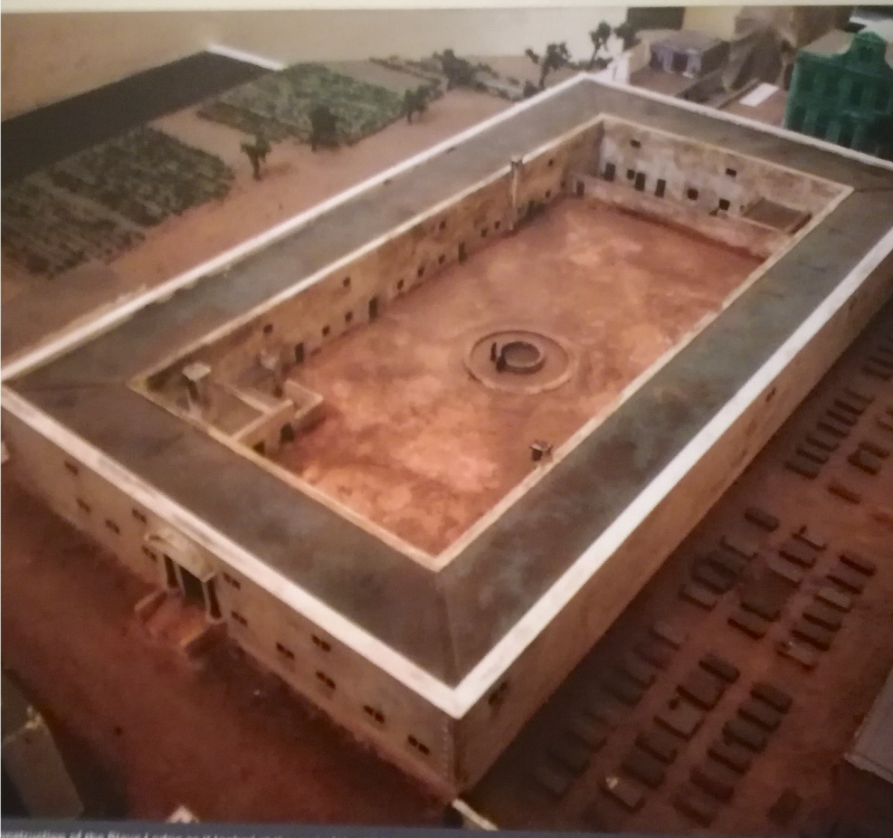
Construction of the Slave Lodge as it looked at the end of the 18th century. During the second half of the century, the front door of the Lodge opened on to present-day Parliament Street, whereas today's front entrance opens on to Adderley Street.

Builder: Peter Lapinder, 1999. (Iziko Museums of Cape Town)